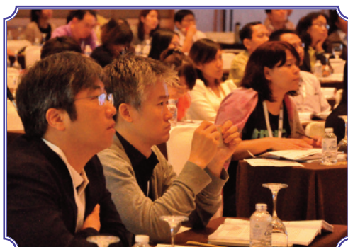
5. Where, when?