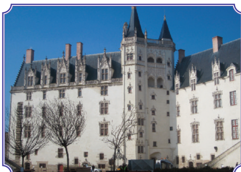
7. Where, when?