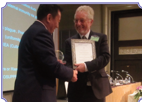
10. Who, what, where, when?