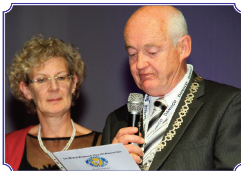
1. Who, what, where, when?