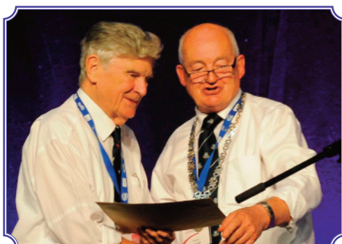
9. Who, what, where, when?