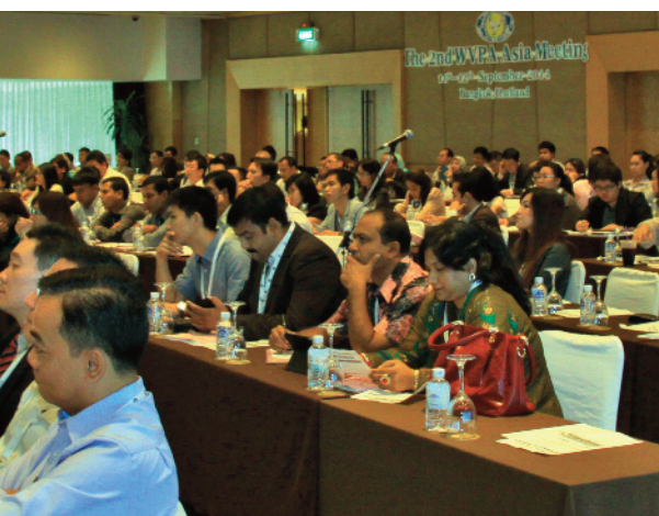
Delegates at the 2014 event held in Bangkok, Thailand.

assist two members of each Asian Branch of WVPA, to attend this meeting. Officers of the branches involved are responsible for selecting the recipients of this grant from their countries and enquiries should be directed to them in the first instance.