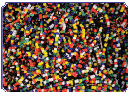
8. What, where, when?