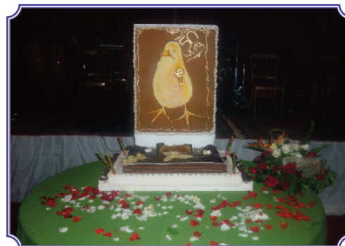
2. What, where, when?