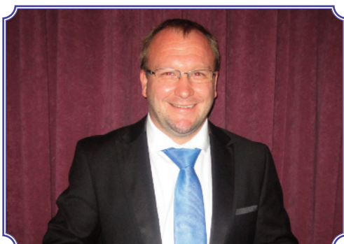
3. Who, what, where, when?