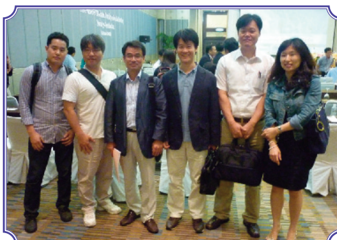
6. Who, where, when?